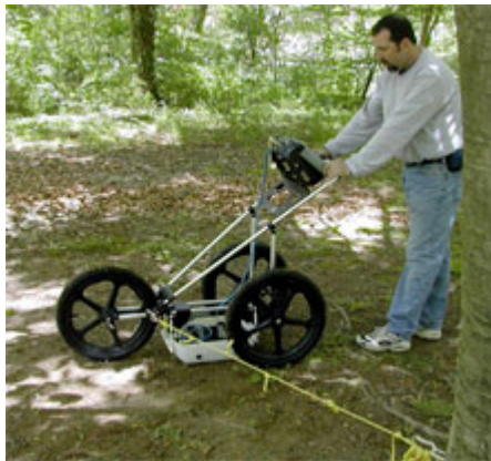
Figure 3. Utilizing TRU system to locate roots.